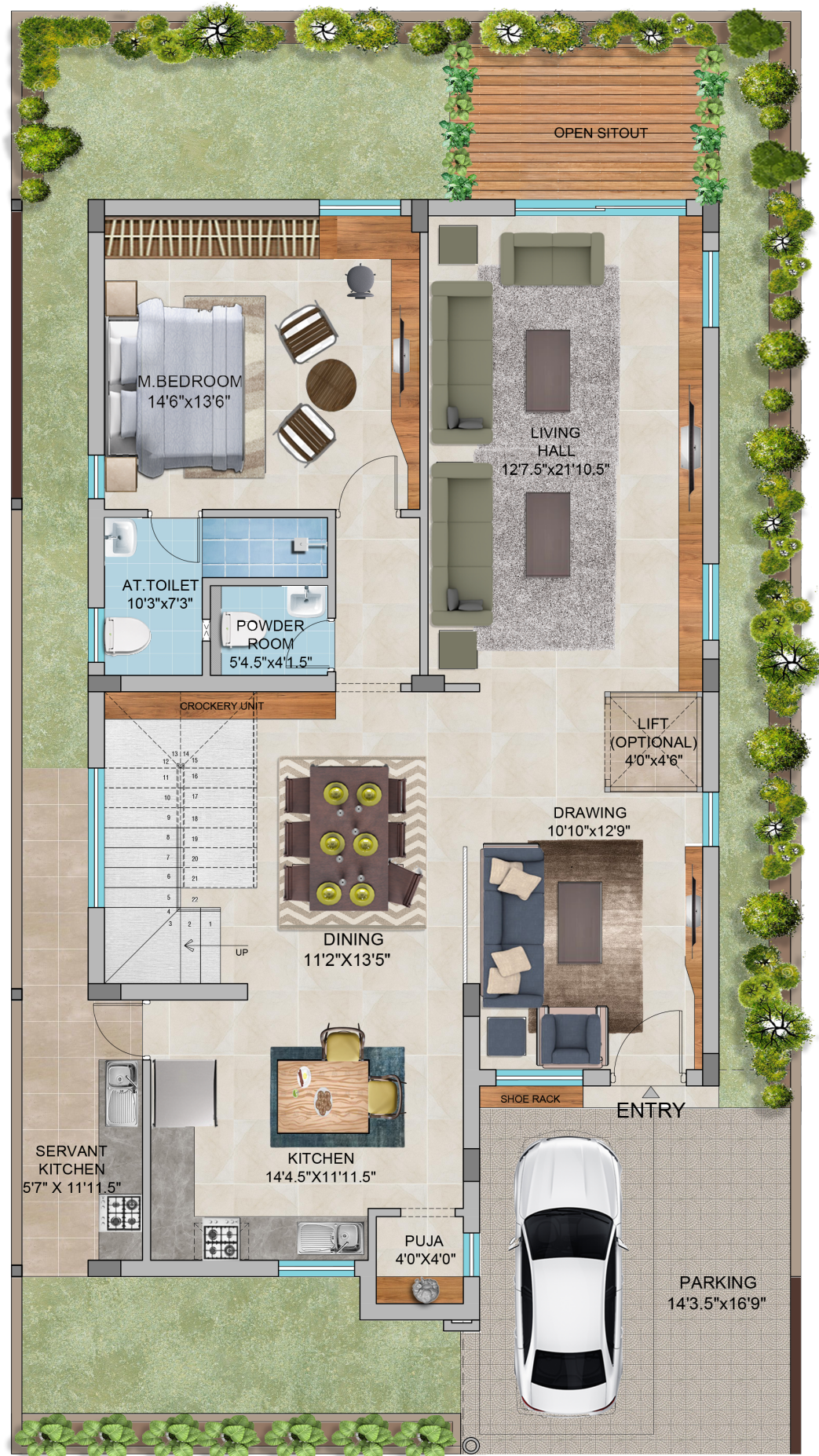
30' 0" WIDE ROAD GROUND FLOOR PLAN